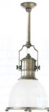
STYLE SELECTION Redefine lighting in a unique way with this rustic pendant, finished in antique nickel and featuring an elegant, white glass shade. Country Industrial Pendant, $694; circaighting.com

Interior finishes were chosen to reflect the owners' need for comfort and livability. Floors of reclaimed white oak clad the main living areas, while Venetian plaster walls add simplicity. Marble was incorporated in the bathrooms to mimic the feeling of a luxurious hotel. "She wanted elements of femininity in the home, so she could have a retreat away from the master bedroom," Vallone says. As for the husband's masculine