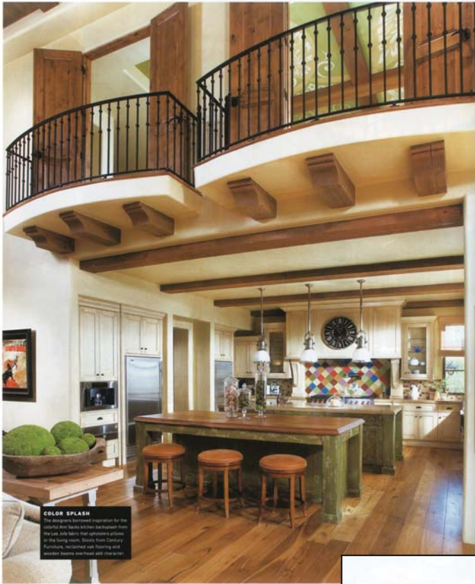
COLOR SPLASH The designers selected wallpaper for the colorful and subtle backdrop from the Lee Joplin fabric that softens pillows in the living room. Seating from Century Furniture, reclaimed oak flooring and wooden beams contrast and characterize.