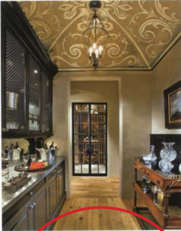
PATTERN PLAY An intricate painted ceiling by LuAnn Beardmore in Scottsdale creates an interesting focal point in the narrow butler's pantry. The serving cart is by Sarreid, and zinc countertops are by Grayleaf Studio.