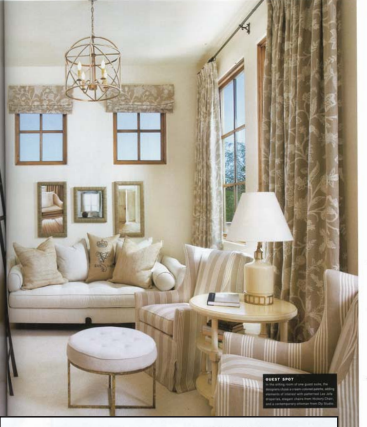
GUEST SPOT In the sitting room of one guest suite, the designers chose a cream-colored plaid, adding touches of red and green with patterned Lee Jaffe armchairs, elegant chairs from Hickory Chair, and a contemporary chandelier from the Studio.