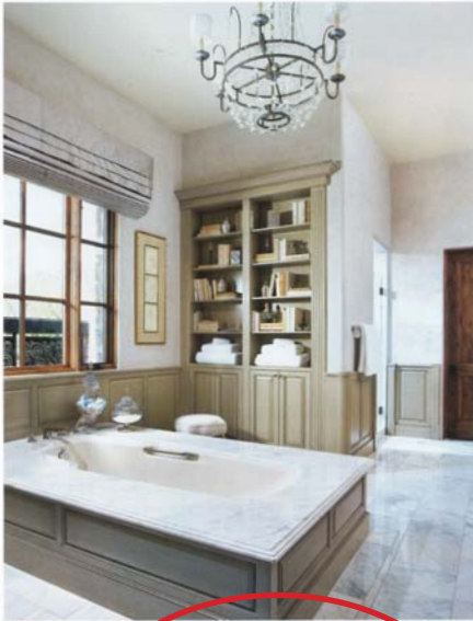
PREMIUM WASH Created to look and feel like a luxury hotel with a feminine vibe, the wife's personal bath features a Kohler tub set atop Calacatta marble flooring from Arizona Tile. Chandelier is from Arteriors Home.