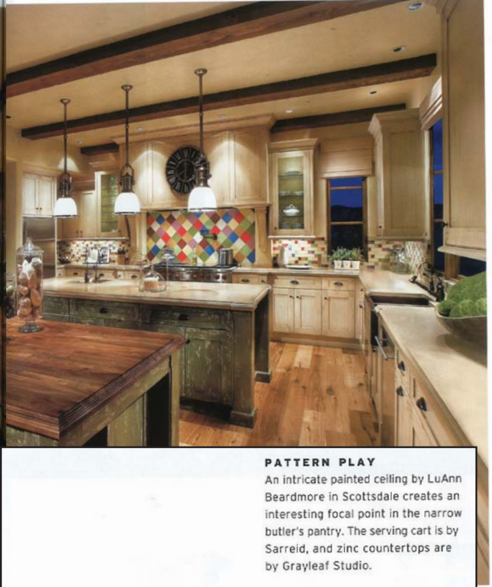
PATTERN PLAY An intricate painted ceiling by LuAnn Beardmore in Scottsdale creates an interesting focal point in the narrow butler's pantry. The serving cart is by Sarreid, and zinc countertops are by Grayleaf Studio.