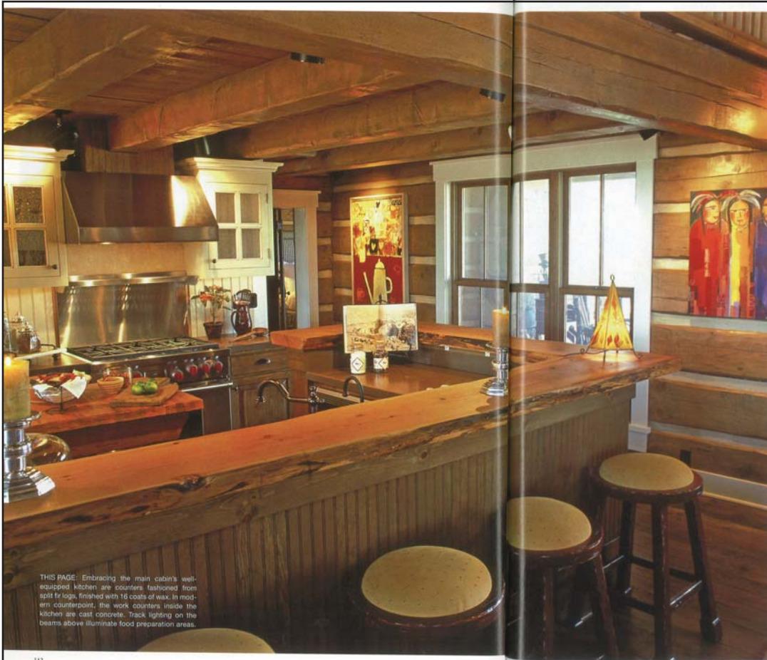
THIS PAGE: Embracing the main cabin's well-equipped kitchen are counters fashioned from split fir logs, finished with 16 coats of wax. In modern counterpoints, the work counters inside the kitchen are cast concrete. Track lighting on the beams above illuminate food preparation areas.

The goal of design covenants at Las Campanas "is to allow the West's and Southwest's historic architecture to be honored," says Marquez. In the case of the Cushing home, that ideal came to life in a 2,500-square-foot master cabin and 1,000-square-foot guest cabin made from pine logs, just as the region's pioneers might have done.